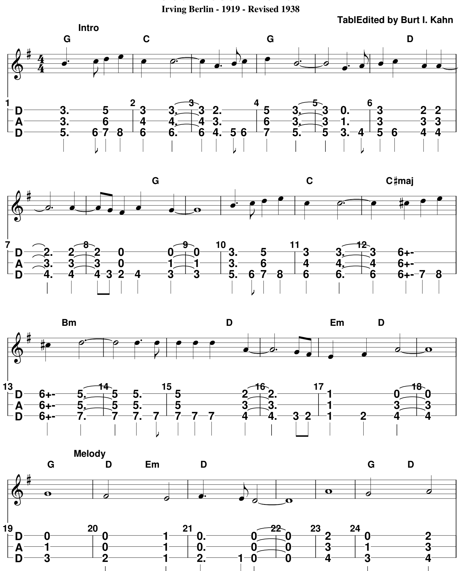
Page 1/3 Tablature and Arrangement by Burt I. Kahn